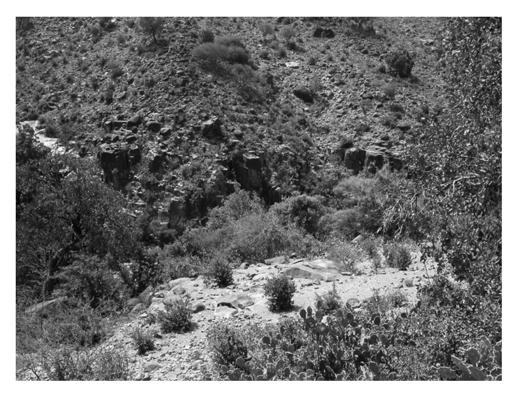
FIG. 2. A patch of degraded valley forest in Wadi Tawlaq, Jabal Melhan.

the valley forest is in a degraded state compared with that found in Wadi Rijaf on Jabal Bura (see Fig. 2). The majority of the valley slopes are covered in an Acacia shrubland that is dominated by Acacia ehrenbergiana Hayne, the Arabian endemic Acacia johnwoodii Boulos and Acacia tortilis (Forssk.) Hayne. A relatively dense area of vegetation is found in a very narrow band alongside the wadi channel from approximately 400–750 m. The wadi channel is littered with large boulders and slopes gently at about 5% gradient.